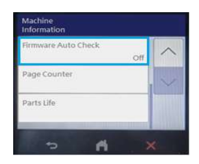
Auto Firmware update disable