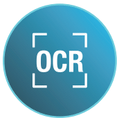
Optical Character Recognition

Higher Duty Cycles and Periodic Maintenance Intervals provide greater volume with fewer routine service calls so you can stay focused on productivity.